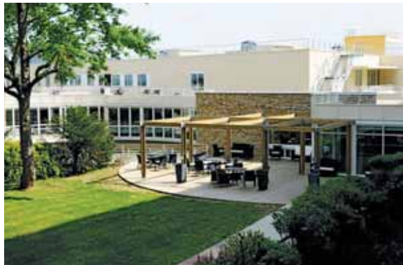
HPGM les Magnolias (Ballainvilliers 91, France)